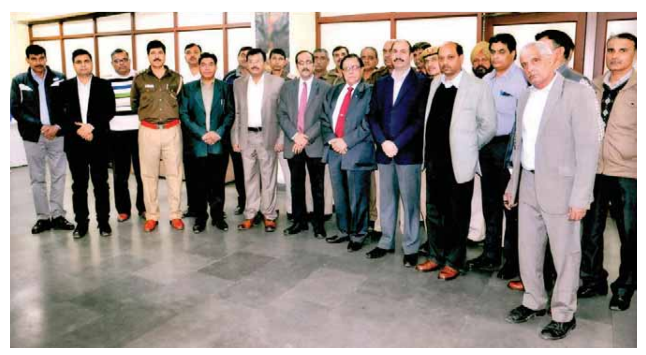
Group Photo of Participants during Three Days State Level Training Program on Social Defence Issues for Police Functionaries held at New Delhi in Collaboration with Delhi Police Training College From 7<sup>th</sup> – 9<sup>th</sup> Dec 2015

During the Financial year 2015-16, the Social Defence Division covered 720 beneficiaries through 18 training & sensitization programmes at National, State and Regional level. These Programmes