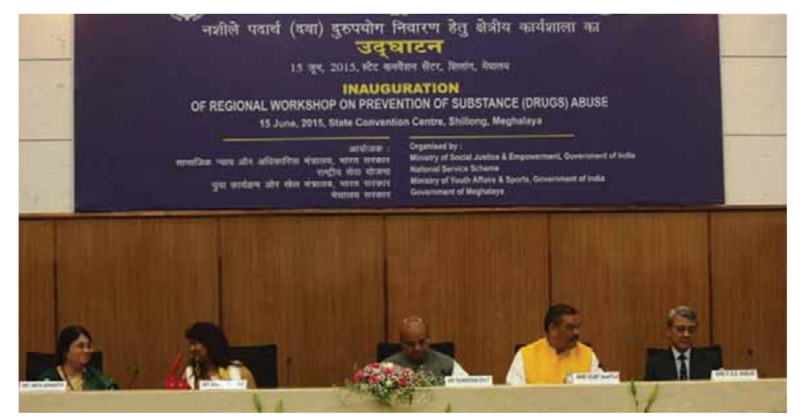
Hon'ble Minister, Shri Thaawarchand Ghelot during the inauguration of Regional Workshop on Prevention of Substance (Drug) Abuse at NEHU, Shillong from June 15 to 17, 2015

The Institute in collaboration with the Ministry organised a Regional Workshop on